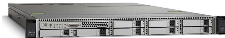
Figure 1. Cisco UCS C220 M3 Server

The Cisco UCS C220 M3 interfaces with Cisco UCS using another unique Cisco innovation: the Cisco UCS Virtual Interface Card. The Cisco UCS Virtual Interface Card is a virtualization-optimized Fibre Channel over Ethernet (FCoE) PCI Express (PCIe) 2.0 x8 10-Gbps adapter designed for use with Cisco UCS C-Series servers. The VIC is a dual-port 10 Gigabit Ethernet PCIe adapter that can support up to 256 PCIe standards-compliant virtual interfaces, which can be dynamically configured so that both their interface type (network interface card [NIC] or host bus adapter [HBA]) and identity (MAC address and worldwide name [WWN]) are established using just-in-time provisioning. In addition, the Cisco UCS VIC 1225 can support network interface virtualization and Cisco ® Data Center Virtual Machine Fabric Extender (VM-FEX) technology.