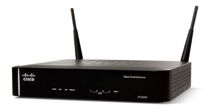
Figure 1. Cisco RV220W Network Security Firewall

To help further safeguard your network and data, the Cisco RV220W includes business-class security features and optional cloud-based Web filtering. Setup is simple, using a browser-based configuration utility and wizards.