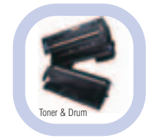
Toner & Drum